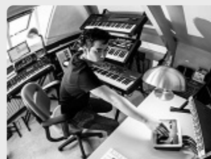
Audients With Shook