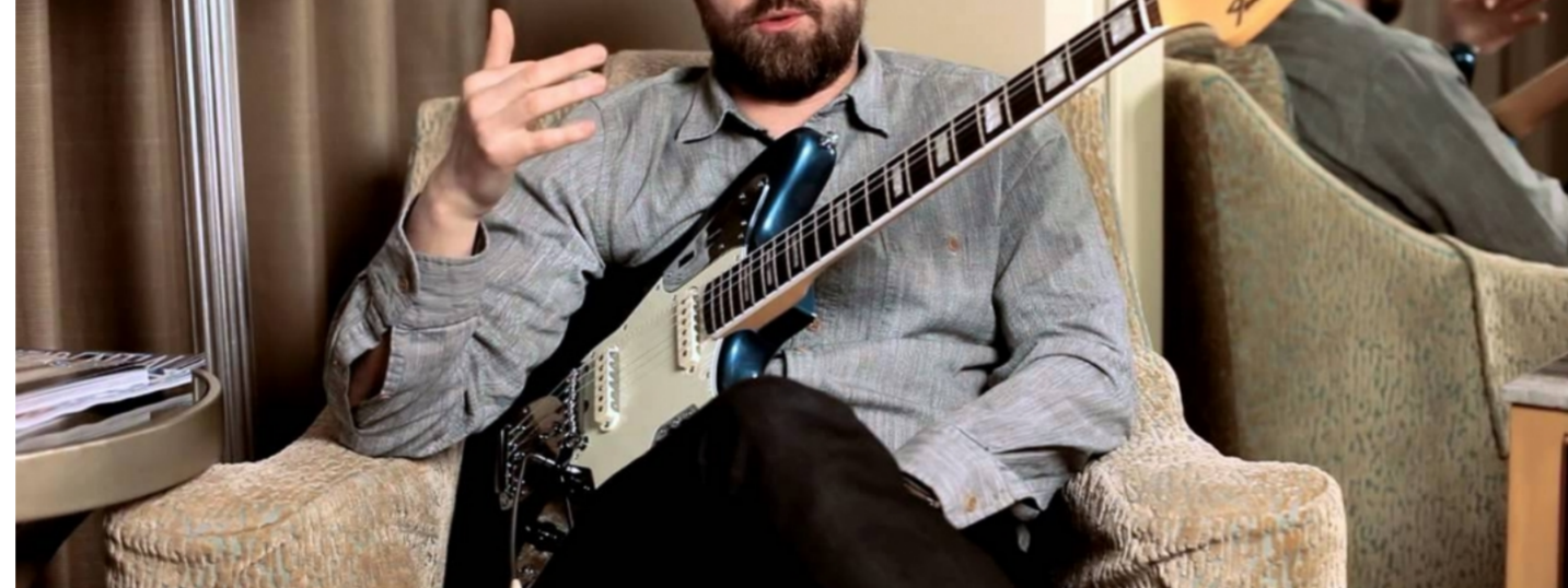
Noel Hogan from the Cranberries supports #limerick2020

During September, said Mr Hogan, there had been a month-long culture extravaganza in Limerick called the 061, referencing the dialling code for Limerick.