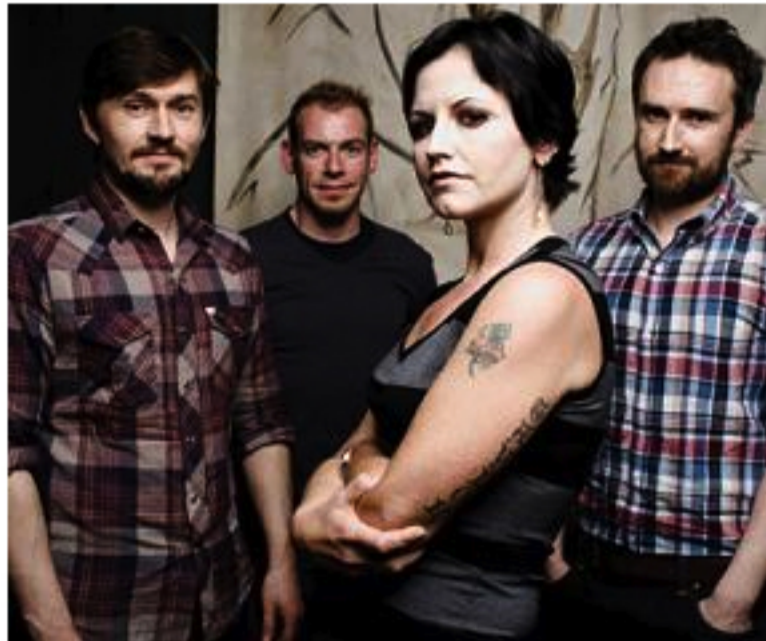
The Cranberries returns to Manila in April