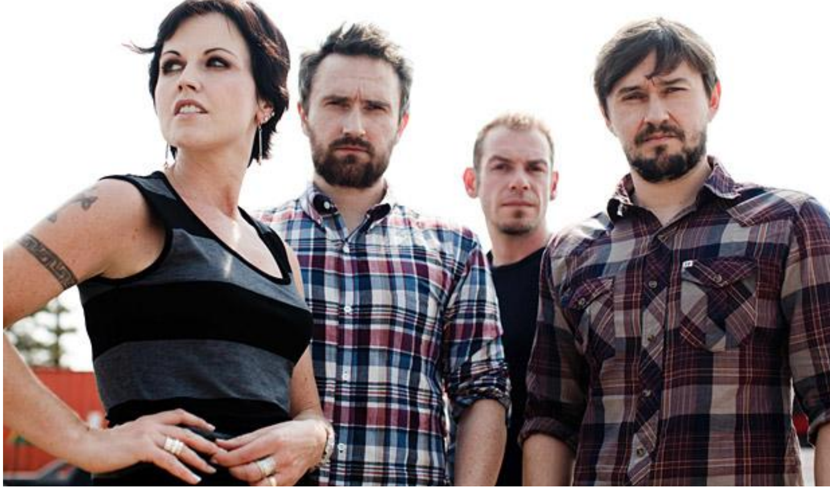
Exclusive: The Cranberries Giving You 'Roses' on Valentine's Day

By Gary Graff | October 05, 2011 1:45 PM EDT