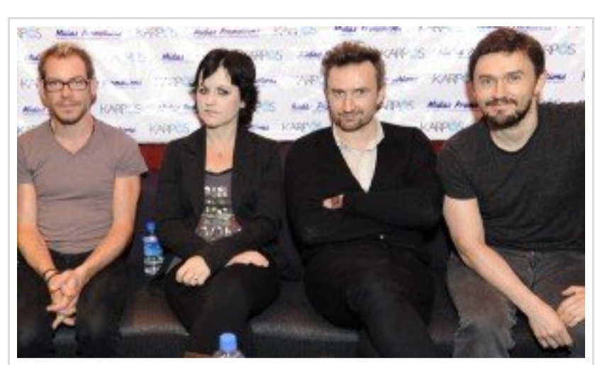
The Cranberries (from left): drummer Fergal Lawler, vocalist Dolores O'Riordan, guitarist Noel Hogan and bassist Mike Hogan.

MANILA, Philippines—The Irish rock band Cranberries arrived Monday, April 9, in Manila and spoke to the media before its concert on Tuesday, April 10, at the Smart Araneta Coliseum.