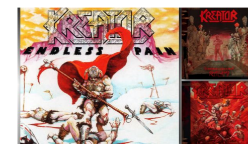
Big Four For Kreator As Reissues On The Way.