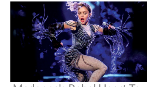
Madonna's Rebel Heart Tour Comes To DVD & Blu-Ray.