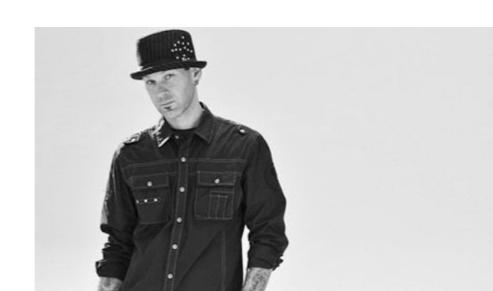
Black Star Riders Announce New Drummer.