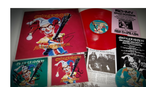
Jamming With Adrian Smith, Meeting Bruce Dickinson & An Accident Of Birth.