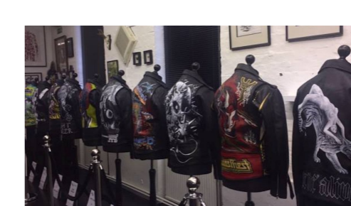
Rob Halford Hell Bent For Leather At Judas Priest Exhibition Launch.