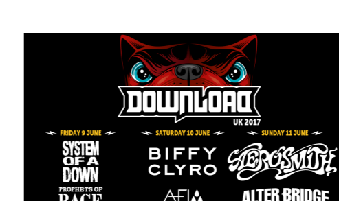
Download Festival Adds A Further Twenty Bands.