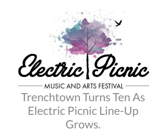
Electric Picnic Music and Arts Festival Trenchtown Turns Ten As Electric Picnic Line-Up Grows.