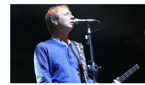
John 'Rhino' Edwards On Revenge, Parfitt & Quo.