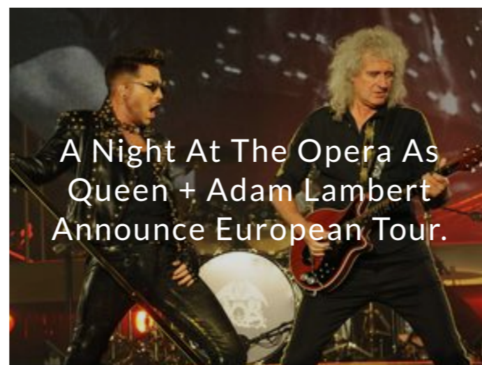
A Night At The Opera As Queen + Adam Lambert Announce European Tour.