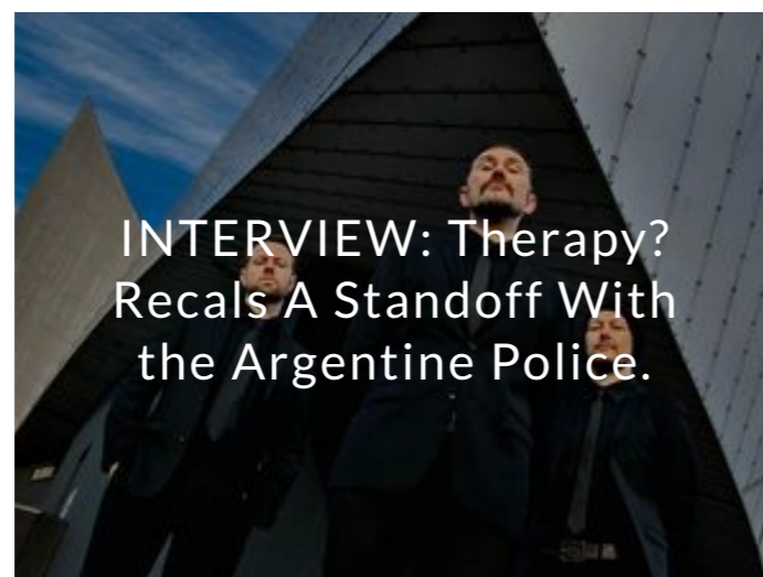
INTERVIEW: Therapy? Recals A Standoff With the Argentine Police.