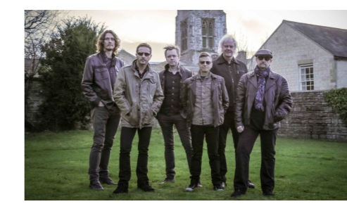
Neil Murray Chats Snakes, Sabbath, Queens & Maidens.