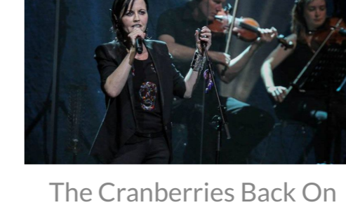
The Cranberries Back On Home Turf For First Belfast Show In 14 Years.