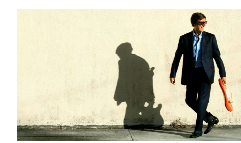
Hank Marvin On 'Without A Word' & His Astonishing Career.