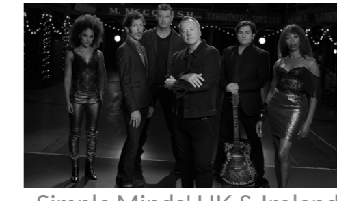
Simple Minds' UK & Ireland Acoustic Trek Nears.