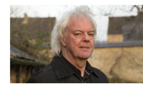
Snakemaiden: Neil Murray Reveals Work With Iron Maiden's Adrian Smith.