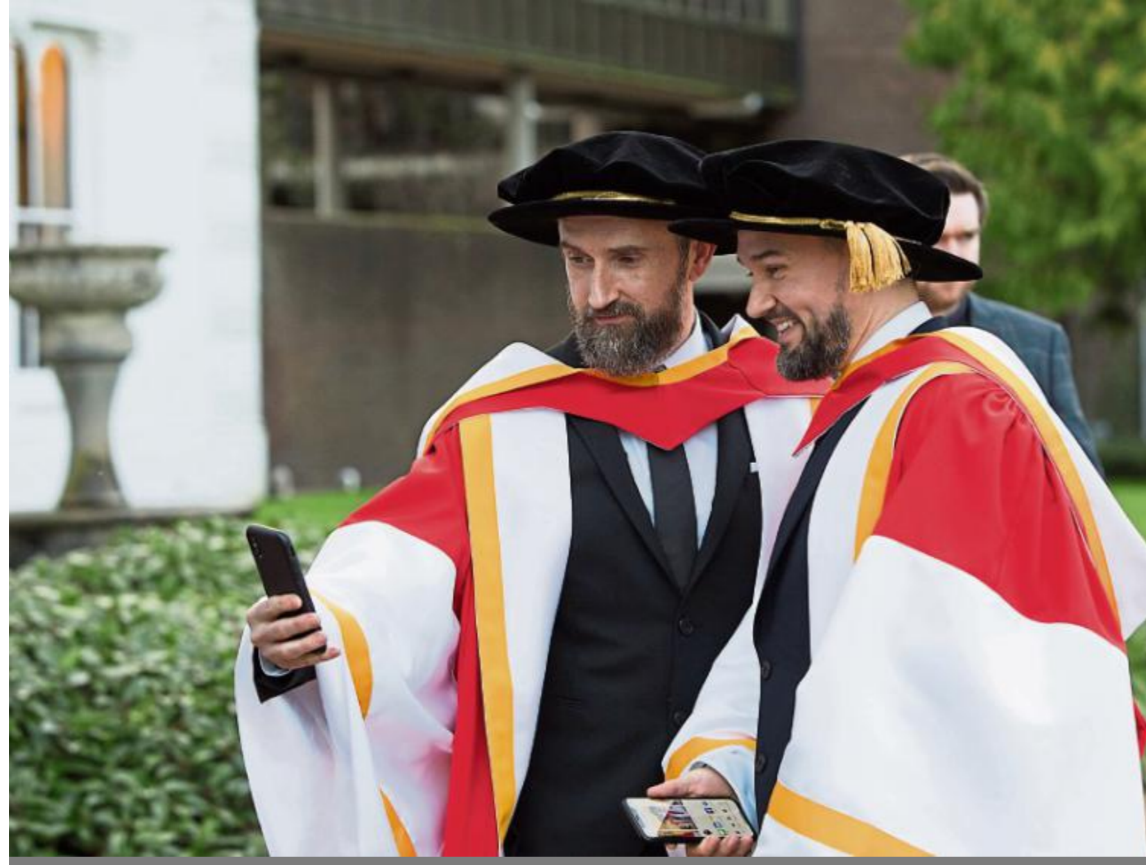
Cranberries band members Noel and Mike Hogan take a selfie at UL, where they were recently conferred with honorary doctorates