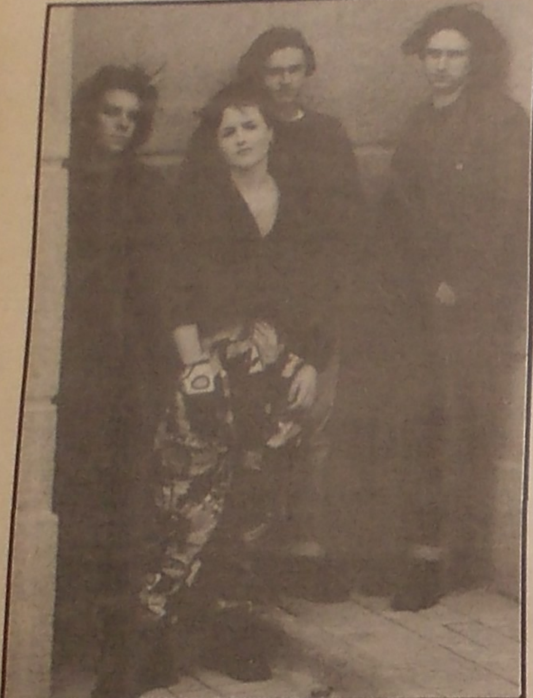
The Cranberries loitering with intent.