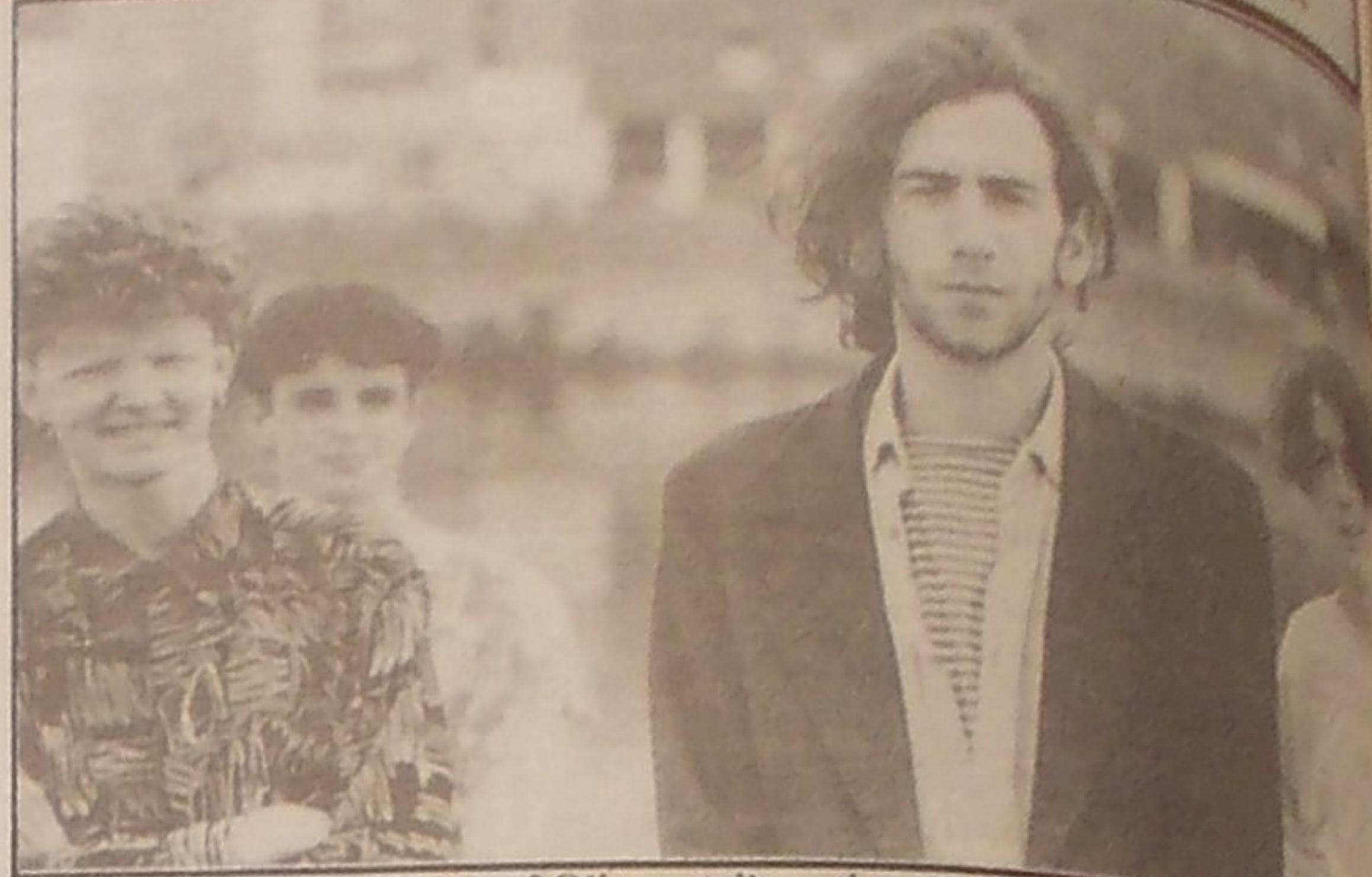
A Touch of Oliver strike a time honoured U2 pose!

This also seems like an opportune moment to put The Cranberries latest four track tape through the mincer. Blessed with a lead singer who's capable of melting even an Eskimo's heart, the fruity ones have been building up a sizable following with their hauntingly atmospheric doodlings which sound like a blissful union between The Cure and The Sundays. Part the attraction is their youthful innocence, The Cranberries give the impression they're only just beginning to discover what life's all about and Dolores' endearingly naive lyrics are enough to bring a tear to the eye of an old fart like me who waved farewell to his teens when she was still at primary. 'Nothing Left At All' kicks things off, a thoughtful song very much in the 'Linger' vein with seductively effective multi-tracked vocals, delicate guitarwork and rumbling feedback courtesy of producer Pearse Gilmore. Pearse also makes a guest appearance on 'Pathetic Senses', the interplay between himself and