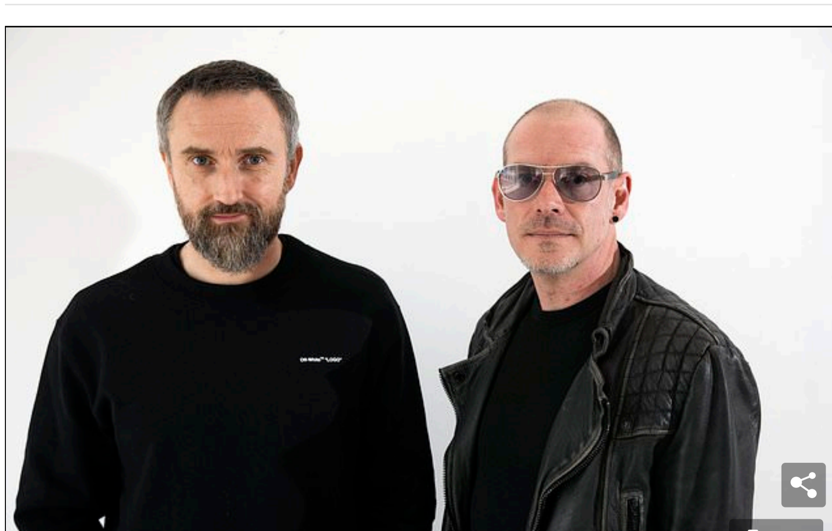
This April 12, 2019 photo shows musicians Noel Hogan, left, and Fergal Lawler, of the rock group The Cranberries, posing for a portrait in New York to promote their eighth and final album, "In the End."