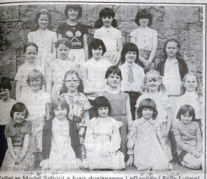
Cailíní as Model School a fuair duaiseanna i nGaeilge i Feile Luimní.