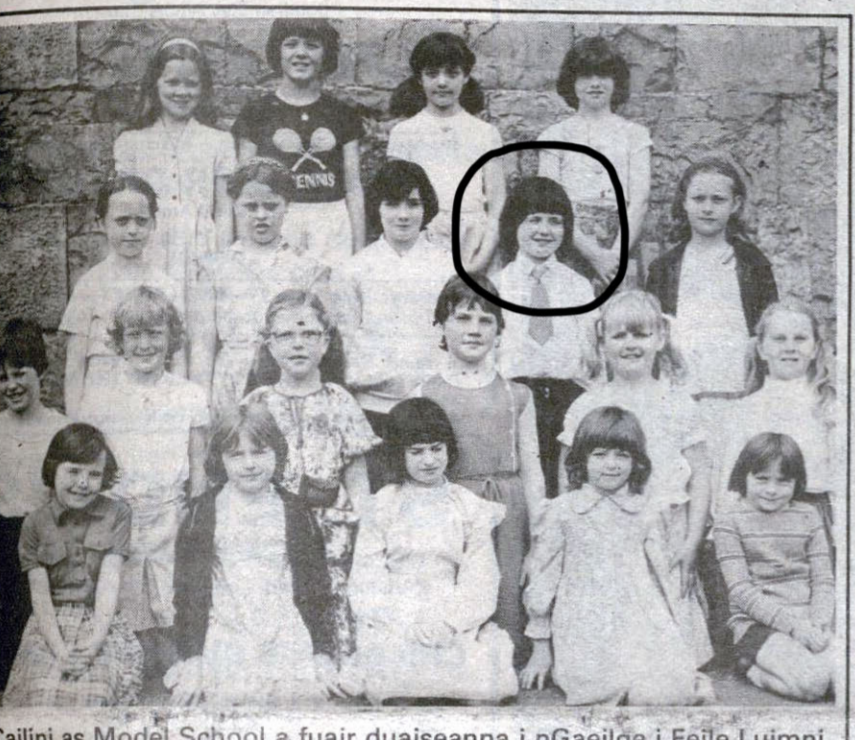
Cailini as Model School a fuair duaiseanna i nGaeilge i Feile Luimní.