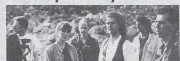
Local favourites Toucandance who are appearing on Sunday night.