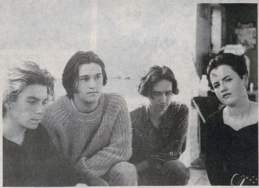
The Cranberry Saw Us (from left): Fergal Lawler, drums; Mike Hogan, bass and backing vocals; Noel Hogan, guitar and backing vocals, and Dolores O'Riordan, lead vocals.

They're recording at Xeric towards the end of the month, and on the gig front, they'll be playing at The Stables on Tuesday, October 30, with The Hitters, and on Saturday, November 10, with A Touch Of Oliver in The Speakeasy. They also plan to play some headline gigs of their own towards the end of the year. With regard to their collective sound, the song has a really memorable chorus and is extremely instant. Next up is "Linger." This is another very mature-sounding effort which has more lovely keyboard, some simple but very effective drumming and another very reasonable chorus. Good stuff! "Chrome Paint" is the weakest of the songs included because, I think, it explores an