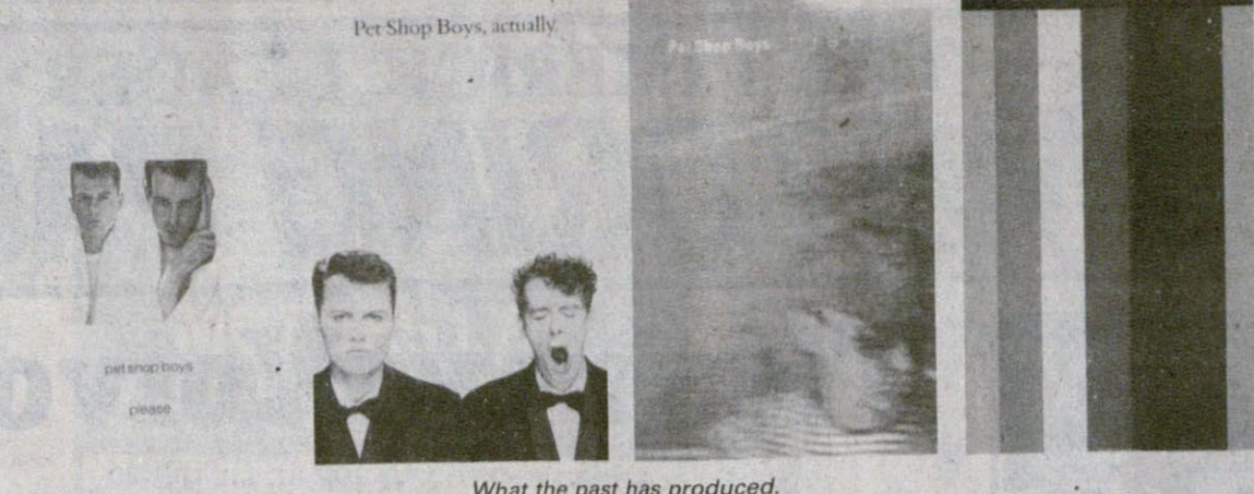
What the past has produced.

Ernest Saves Christmas (Family): Christmas is coming and Santa needs some help. But he'd better get it before Christmas Eve or a great many children will be disappointed. Then Ernest comes to the rescue, anxious to please his most favourite person but causing mayhem at every turn. This one will 'Sleigh' you. Jim Varney is Ernest P. Worrell in a season's sackful of fun festivity. U.H.F. (Ultra High Fun) 'PG': Get on the right wavelength for the tuckiest, most outrageous comedy yet... the whole, uncensored, behind-the-scenes story of the world's worst television station where inanity of the game shows is surpassed only by the ineptitude of the presenters. Introducing 'Weird' Al Yankovic, a new name. And, boy does he need one! Watchers II (Thriller) '18': There's no way you can ignore a Roger Gorman film. And his latest one is no exception. A botched, scientific experiment unleashes a hideous beast... fierce, deadly, inhuman and unstoppable. Marc Singer and Tracy Scoggins take on the terror in Watchers II. TAKE ONE HOME TONIGHT!