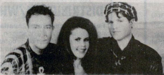
The B-52's . . . Fred Schneider, Kate Pierson and Keith Strickland.

THE B-52's, one of pop music's deliciously infectious bands, make their first long-awaited visit to these shores when, for one night only, they play the Point Depot on Wednesday next, February 24. In their own surreal way, the B-52's are as quintessentially American as the Beach Boys. Sixteen years into a career that began as a new wave lark in Athens, Georgia, the hugely popular group have become an integral part of the musical cosmos. From "Rock Lobster", "Planet Claire" and "Private Idaho" to "Channel Z", "Room" and the seriously famous "Love Shack", the B-52's have testified their colourful sense of the absurd around infectious dance-rock tunes that start a party every time the music begins. The current chapter of the B-52's story began in 1987 with singers Fred Schneider, Cindy Wilson and Kate Pierson and keyboard/guitarist Keith Strickland. Along with Nile Rogers and Don Was producing, the quartet brought the ultra successful Cosmic Thing to earth in the summer of 1989. Four videos, four million albums and 14 months of touring later, the B-52's were on top of the world. Then Cindy decided to leave the band, bowing out just prior to the first bout of songwriting for the new album . . . the door, however, is always open for her to return. Thus, the B-52's became a trio. Back into the studio trotted the trio and the resulting offer-