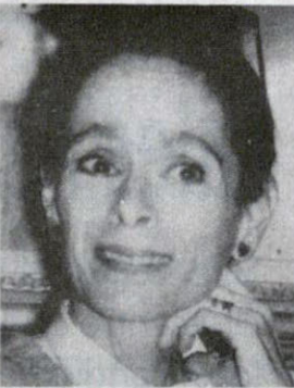
Geraldine Chaplin, Charlie's real-life daughter, who stars in the film on the little girl seen in Chaplin's Limelight 40 years ago.