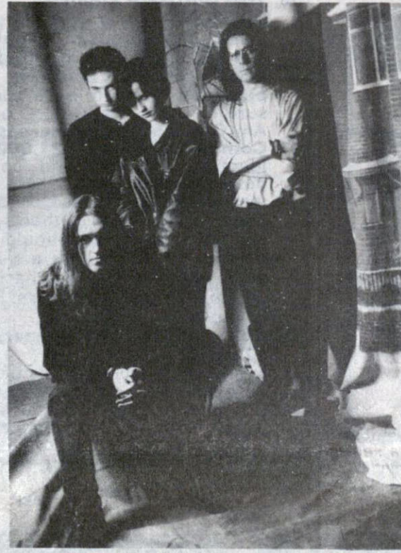
On the road to stardom . . . The Cranberries.

THIS has to be the one . . . "Linger" is the new single from Limerick band The Cranberries and surely this is the one that will break them into the big time both nationally and across the water. Coming just two weeks before the release of their much awaited debut album—Every One Is Doing It, Why Can't We—"Linger" is a world-class track that many a band with years more experience than The Cranberries would be only too delighted to call their own. Their songwriting ability and the production talents of Stephen Street—employed both on this single and the album—looks like it could be a real winning combination. I've said it many a time before and, as they say, what's one more time between friends, this band can, and hopefully will, go on to reach the parts that other Limerick bands couldn't quite manage . . . here's hoping! "Linger" is a tremendous track and the superb, almost exquisite use of rich strings, an uncluttered backbeat and some very nice guitars all go to form