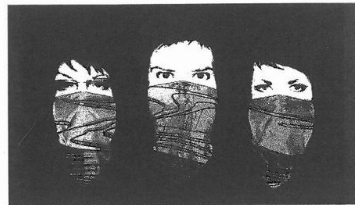
The album cover for D.A.R.K.'s new album, Science Agrees , out May 27. The trio play Dolan's on May 13.

The move comes as The Cranberries gear up for several European shows in June, allowing O'Riordan to put the turbulence of recent months behind her, and with the sneaking suspicion that the band could yet play a gig in Limerick this summer.