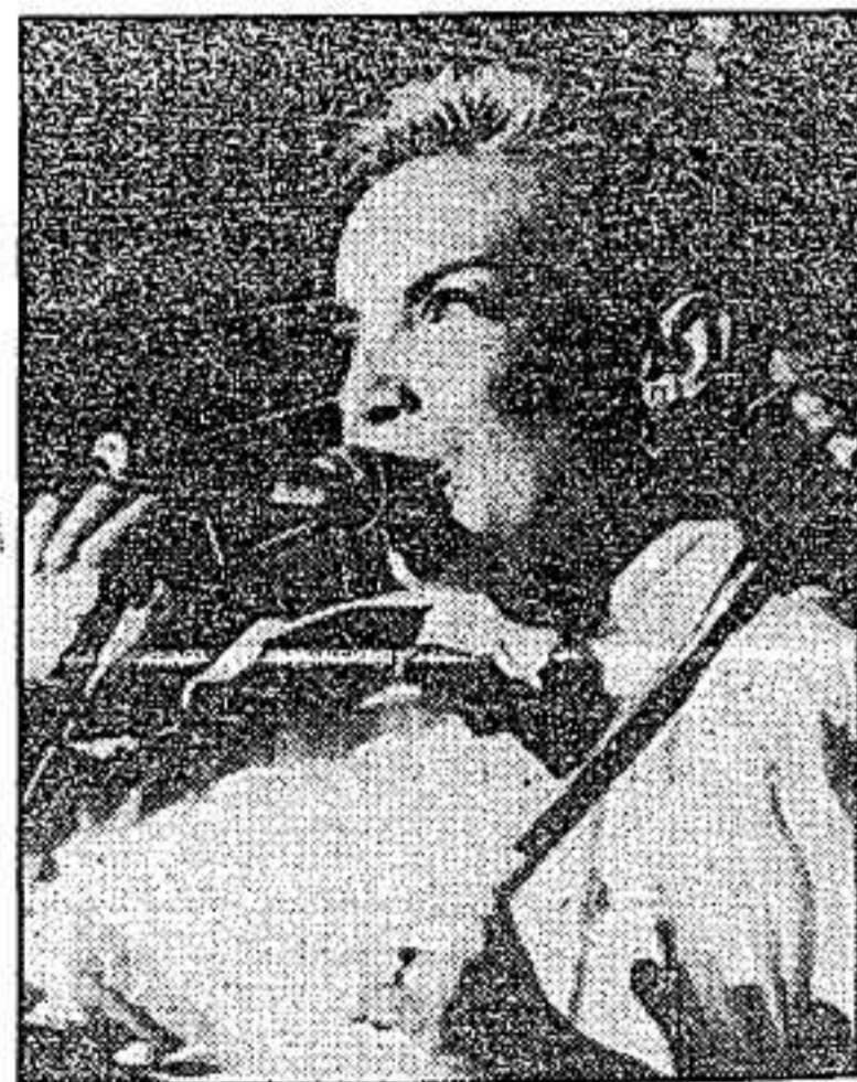
ANNIE LENNOX: on the Woman To Woman album