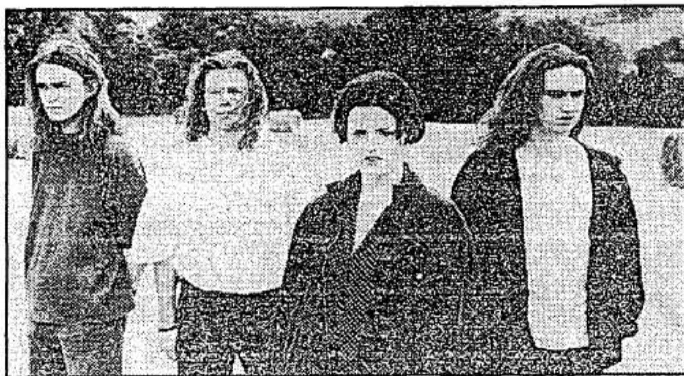
THE CRANBERRIES: supporting The The on US tour

L IMERICK band The Cranberries began a tour of the US last night in Denver.