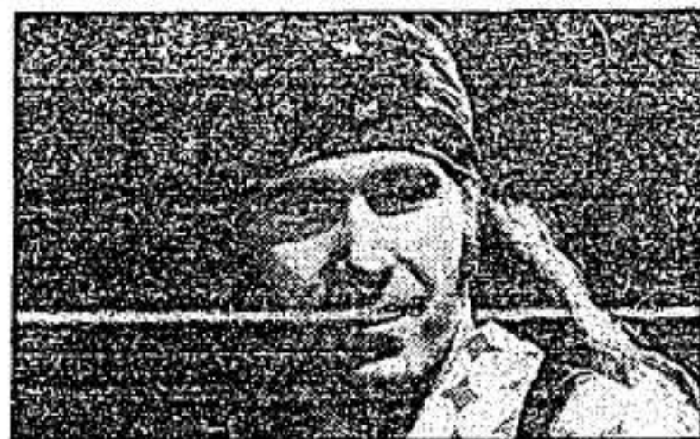
THE EDGE: Zooropa role

The more we can do technically and scientifically, the less we seem able to do politically and socially. Justice and equality recede, unemployment rises inexorably, and old and new nationalisms are tearing Europe apart.