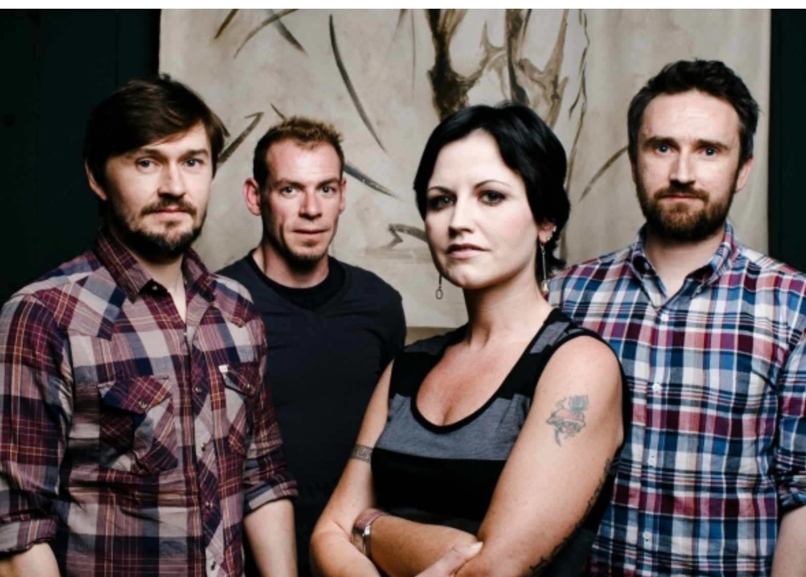
The Cranberries reunited - Mike Hogan, Fergal Lawler, Dolores O'Riordan and Noel Hogan