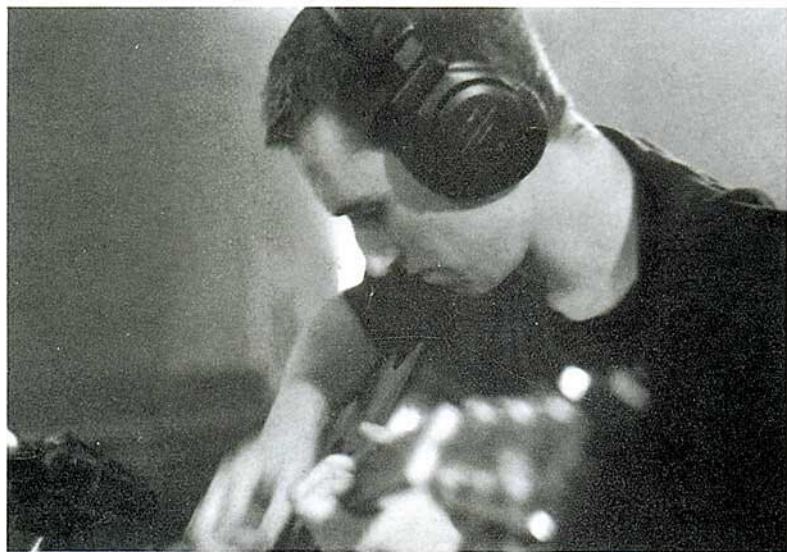
Noel Hogan, on guitar - Holland 1993.