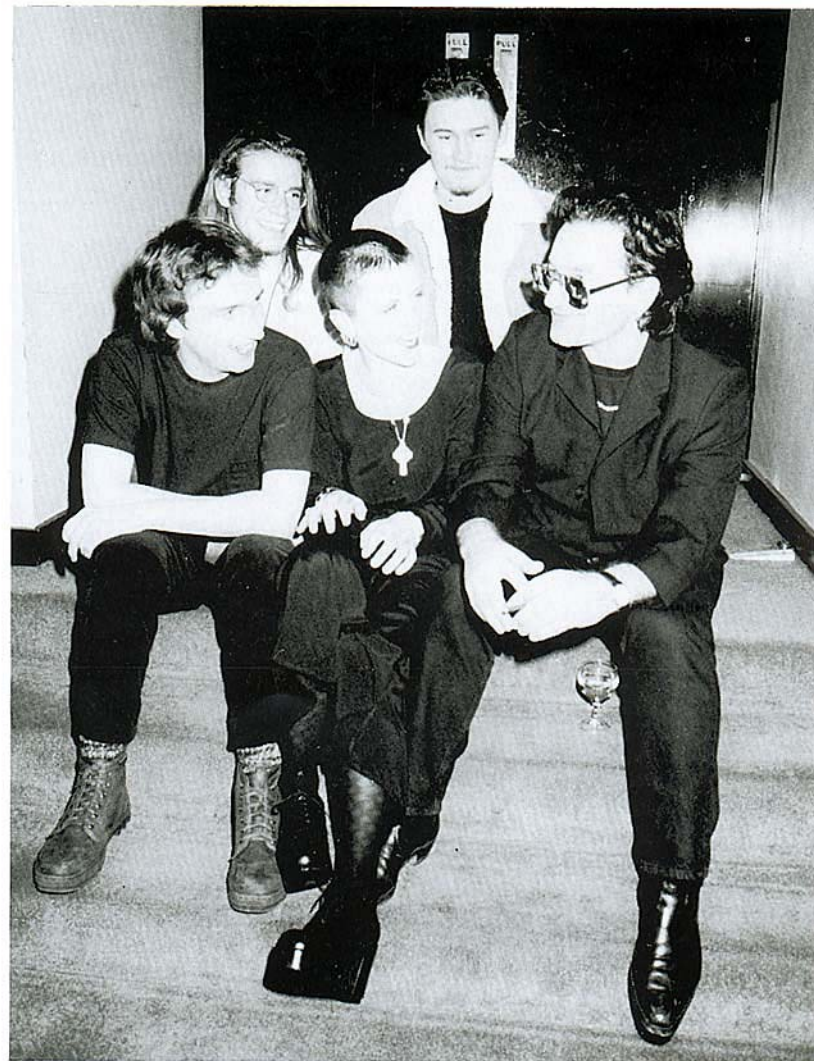
Bono meets “The Cranberries” at the National Entertainment Awards, Dublin, December 1993.

December 1993: “Linger” reaches Number 8 in the USA and the debut album goes platinum there for sales in excess of 1 million units. Rejoin “Duran Duran” and finish US tour at a festival in LA with such bands as “The Smashing Pumpkins”, “Therapy??” and “Belly”. Return to Ireland on December 15th to hugely successful homecoming gigs at the Theatre Royal in Limerick and the Tivoli Theatre, Dublin. The lads beat the likes of U2 at the Irish National Entertainment Awards in Dublin where they are voted best band in the rock category.