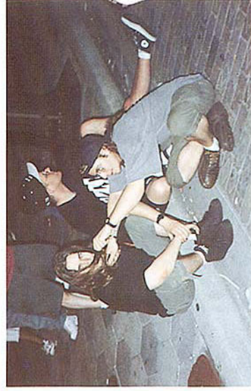
Two little boys with no little toys.