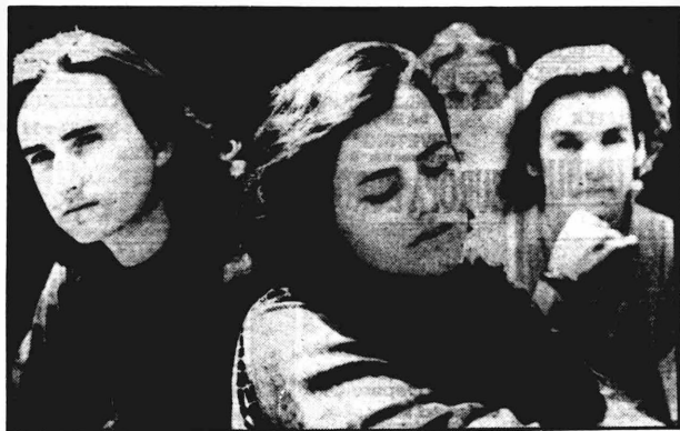
★THE CRANBERRIES: the next two months are crucial for the Limerick quartet