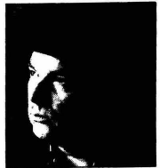
▶ VAN THE MAN: see him in October

THE 10th Aberdeen Alternative Festival kicks off next month with, as they say, something for everyone. Running from October 15-24, the impressive line-up includes chart stars Sunscreen (Bonkers, October 20), Gil Scott-Heron at the Music Hall on the 21st, and Van Morrison at the Music Hall the following night. For his gig, Van the Man teams up with Maceo Parker's JB Horns for the first time since the '70s. This unique pairing of two legends was put together at Van Morrison's request, and should provide a once in a lifetime experience for fans of quality soul and blues. In addition to the usual exhibitions, comedy and traditional music, the festival presents one of the strongest line-ups of local