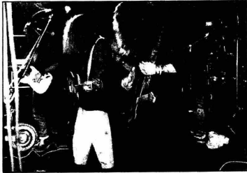
▶ THEY'RE IN THERE SOMEWHERE: The Last Divide. Great band, shame about the picture.

probably the most travelled, having already completed two highly successful Scottish tours since forming just over a year ago. They release a new EP tomorrow night when they play Aberdeen's Lemon Tree. The title track — 'Who Is Truly Scrumptious?' — is already a firm live favourite, and along with the excellent Ethel 'E' Real and Shine, it's a pretty impressive release. Check 'em out!