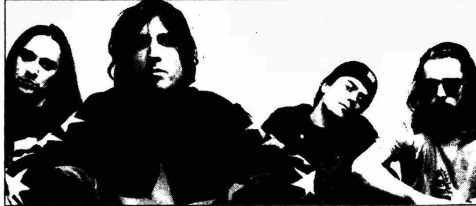
▶ KINKY MACHINE: welcome in the N-east any time.