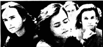
▶ THE CRANBERRIES: see them in Wick this weekend and Aberdeen next month.

The Young Gods — Gasoline Man (Play It Again Sam) Manic Street Preachers — Theme from MASH (Columbia) L7 — Morster (Siash) The Soupdragons — Alone in Chains — Would Please (Big Life) Alone in Chains — Would Please (Epic).