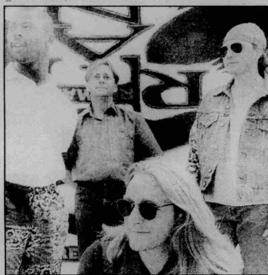
REDMAN: They stepped in to replace Yellowbelly for the benefit at The Mag tomorrow night

It's at The Mag tomorrow night — and most of the day too.