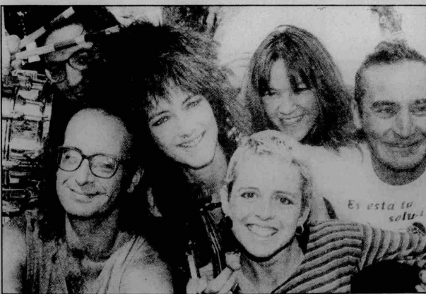
ALTOGETHER, SMILE! Yes it's the cheesy grins of those merry folk band The Barely Works. Catch their unique sounds at Phoenix Arts

T HE brightest hope in roots music at the moment is the organised chaos of The Barely Works (Phoenix Arts, on Sunday), the only band who can put blue-grass, jazz, East European gypsy music and trad folk together in just one item.