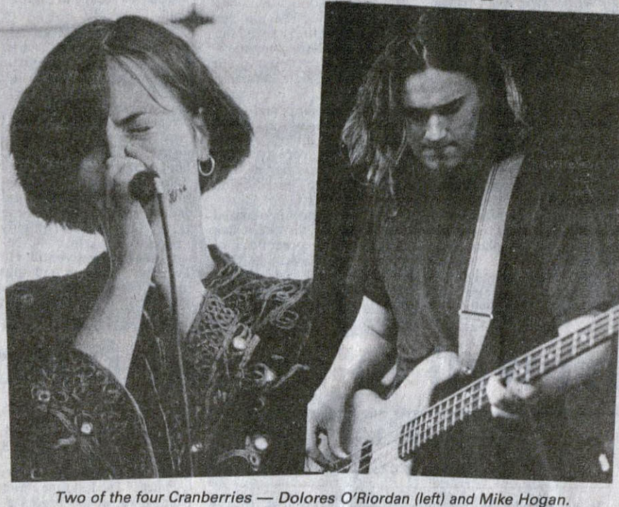
Two of the four Cranberries — Dolores O'Riordan (left) and Mike Hogan.

As I left my house it was more than evident that I'd missed the start of the Lark as I could hear the first band, Colours, doin' the biz in the distance. As I drove towards the Park they were still hard at it and thankfully I did arrive before they left the stage.